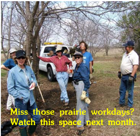
Miss those prairie workdays? Watch this space next month.