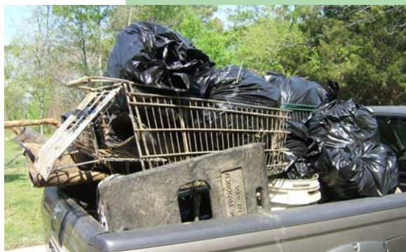
Above right, The Center/Mesquite bridges, our high-profile trashy place for the second year.